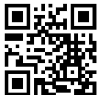
QR-code - purchase fishing permits

"There's only one Ivösjön, take care of it!"